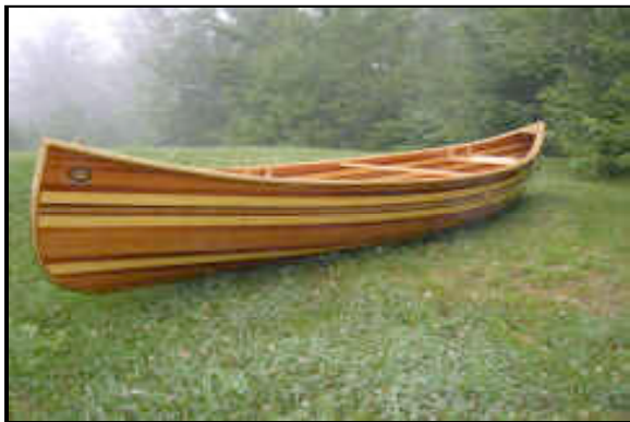
Described as "the ideal all-round canoe", the 16-foot "Prospector" is one of three designs Caouette builds.

After he launched a website, the business took off in the spring of 2006 when Dan sold his first kayak out of "Saco Bound" in Conway. Then he got a call from a Connecticut man who asked him to build a sea kayak that became known as "The Black Pearl". His latest order under construction is for a Spanish customer who wanted something "light, fast and beautiful". The 18 ½ foot "Nereida" Njord is being made out of mahogany, curly maple and black walnut, encapsulated in a clear epoxy/fiberglass matrix and should weigh only 45 pounds. Detailed craftsmanship comes with a cost, but in this niche market, price is not an obstacle for those who want something truly special. It takes Dan 8 to 12 weeks to build a canoe or kayak that can range in price from about $3,000 to $6,000.